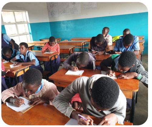
Students writing a self-assessment of their strengths and weaknesses.