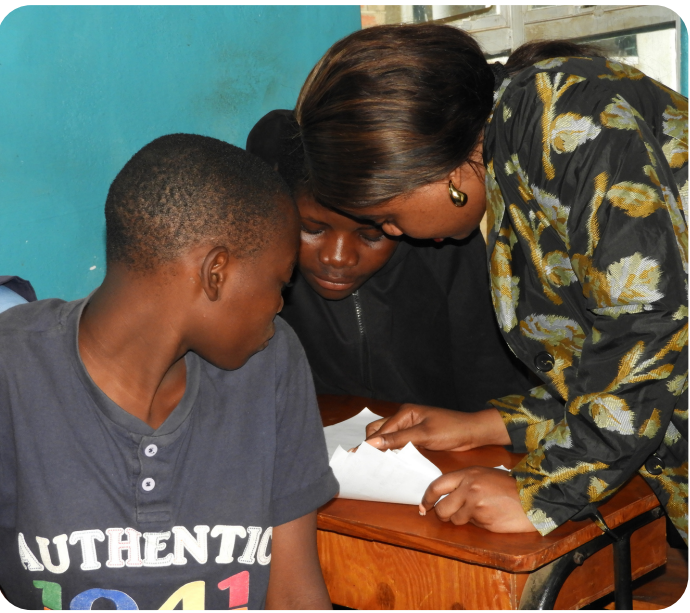
Facilitator guiding a student through the Myers-Briggs Type Indicator (MBTI) assessment and interpretation.