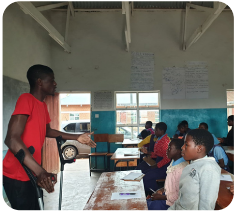
The facilitator is instructing students on the Myers-Briggs Type Indicator.