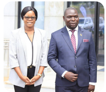
Our E.D. and the Minister of Finance and Economic Affairs at the National Budget Consultations