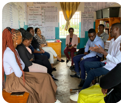
Shoulder to shoulder with giants, MATCH Foundation and Segal Family Foundation teams